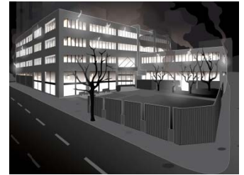
Mona Sharma, Unlimited Resources , digital image, 2015.