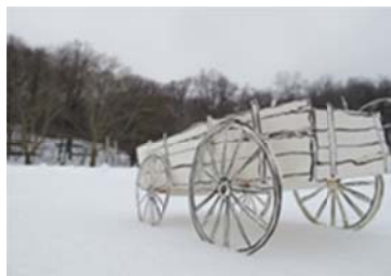
Jimbo Blachly, Drawing Wagon , 2015, Paper, ink, wood, Dimensions variable.