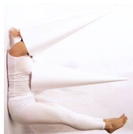
Colleen Asper and Marika Kandelaki, Dictionary of the Hole , 2012. Photograph, dimensions variable (complete work includes text).

The Drawing Center is the only not-for-profit fine arts institution in the country to focus solely on the exhibition of drawings, both historical and contemporary. It was established in 1977 to provide opportunities for emerging and under-recognized artists; to demonstrate the significance and