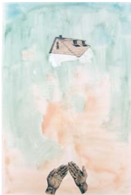
Heather Hart, Oracle of Generosity: Hatim's Rooftop , 2014, 30" x 22", Watercolor monoprint, etching, aquatint, chine-collé, gold, participation, courtesy the artist.